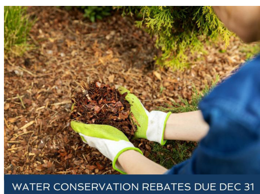
WATER CONSERVATION REBATES DUE DEC 31

Supplementary Tax Notices were mailed October 21.