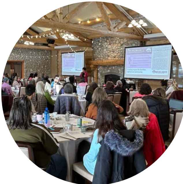
– Interagency Extravaganza, Feb 2024

Thank you for being a part of something meaningful, and for helping us create lasting change.