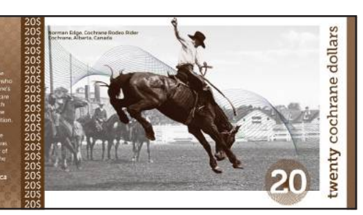
C$20 "Legacy Values" Clarence Copithorne Norman Edge