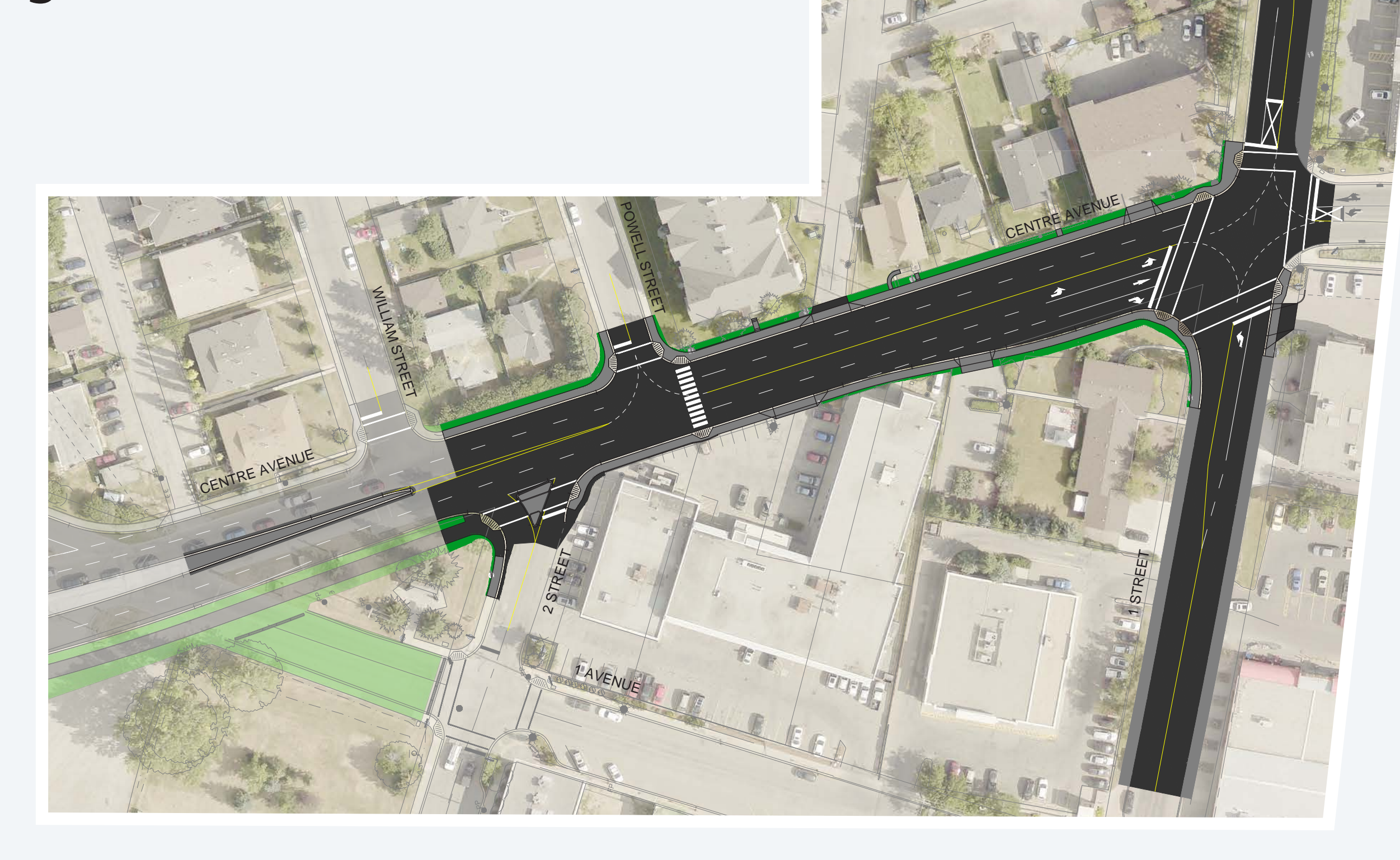
Centre Ave corridor improvements